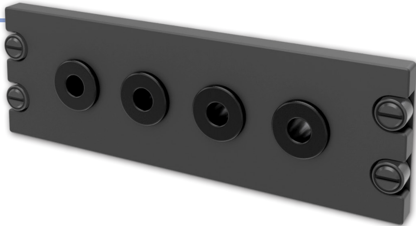
Headset jacks not included