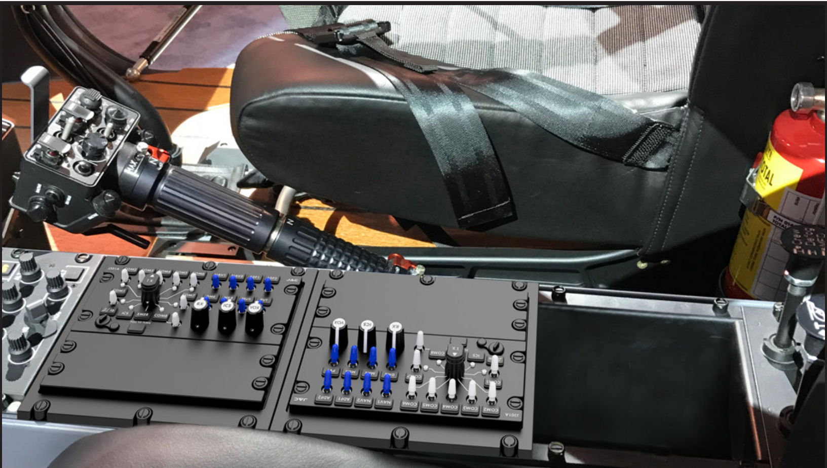
Typical Installation - JA71-S017 shown with J301A and JA71-005 - Pilot and Copilot