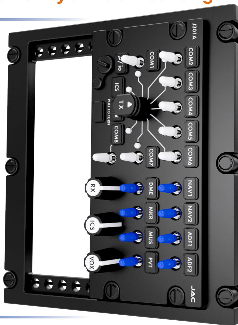
JA71-S017 Shown with J301A