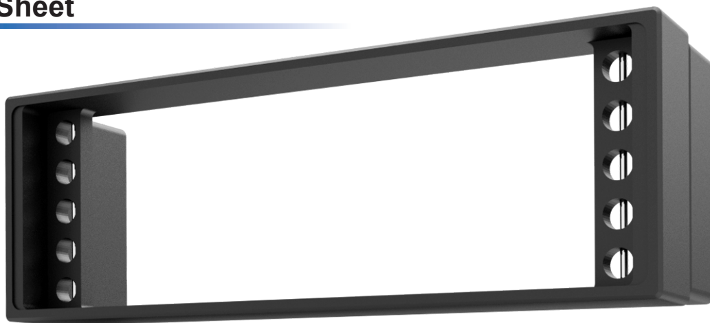
JADT-005 Flat Black