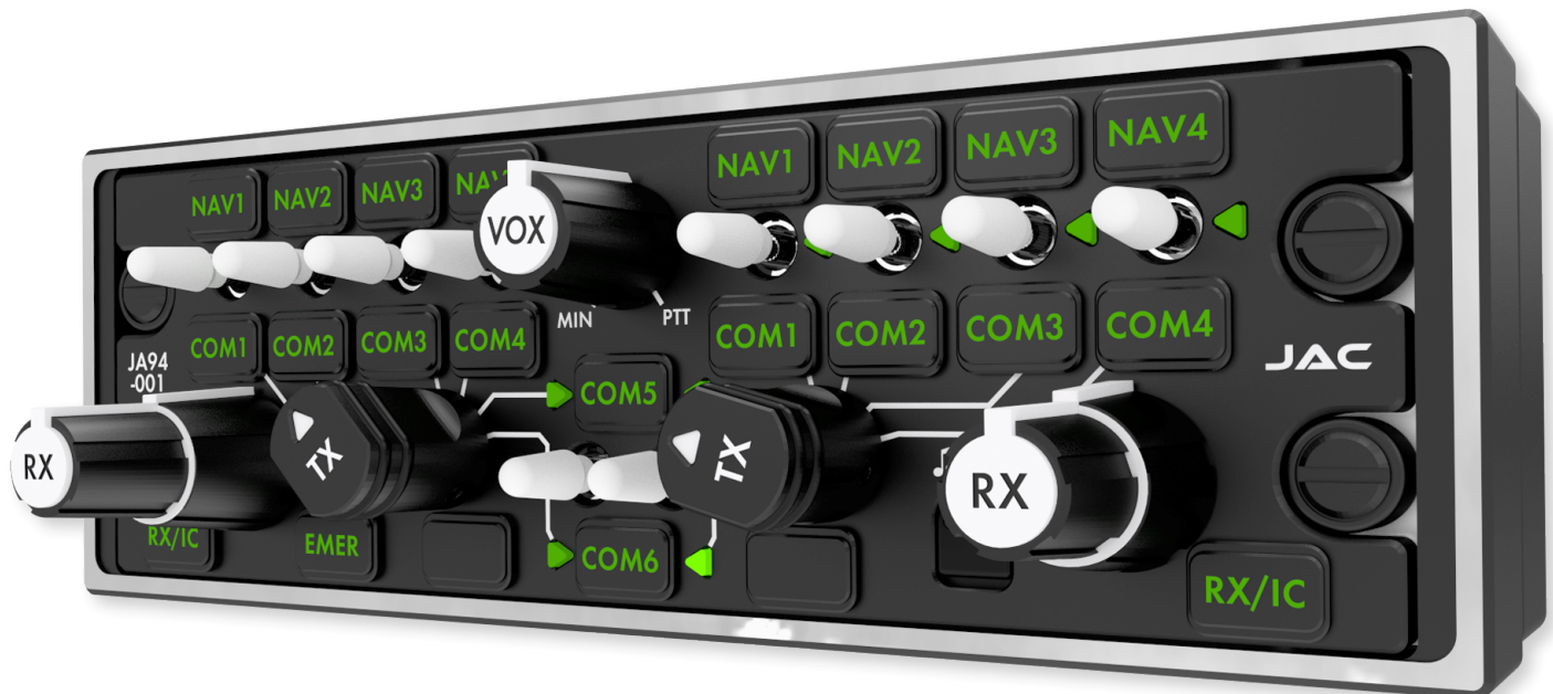
JADT-105 with JA94 Shown